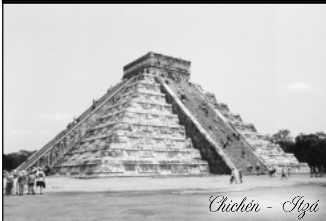
Chichén - Itzá

El Castillo Pyramid (Yucatan). This is the pyramid where the serpent appears on the stairs during the spring/fall equinox.